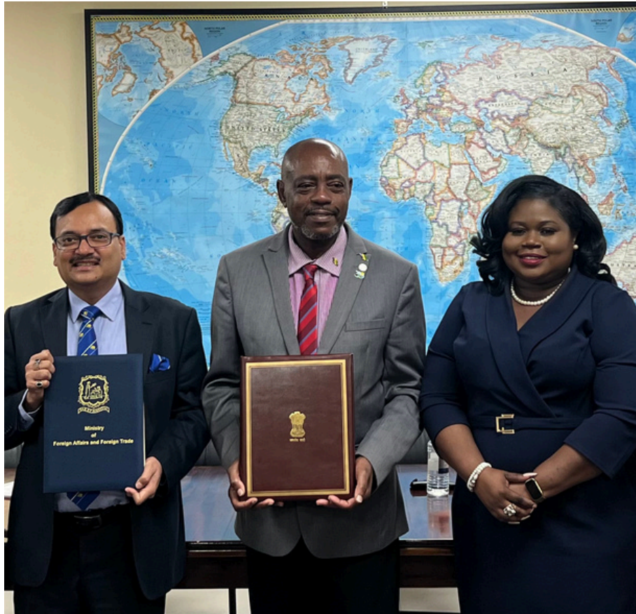
L-R: His Excellency Subnash Gupta; High Commissioner of India, Honourable Frederick Stephenson; Minister of Foreign Affairs, Foreign Trade, and Consumer Affairs, Honourable Keisal Peters; Minister of National Mobilisation and Social Development

The Ministry of Foreign Affairs, Foreign Trade, and Consumer Affairs announced the successful signing for five Quick Impact Projects (QIPs) between the Government of Saint Vincent and the Grenadines and the Government of the Republic of India on February 17, 2025. The signing ceremony marks another significant milestone in the strong and growing cooperation between the two states.