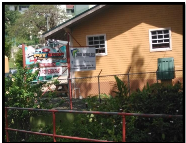
Mc Carthy Office