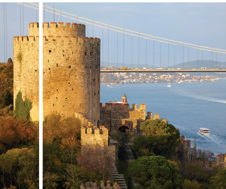
FORTRESS RUMELIHISAR. ISTANBUL