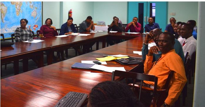
Session with members of the Royal St. Vincent and the Grenadines Police Force

A total of twenty (20) departments within the public service benefited from the Sensitisation drive which incorporated training specific to; The Vienna Convention on Diplomatic Relations 1961, ushering, etiquette, national emblems and other related areas.