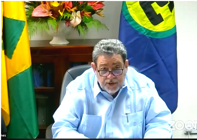
Dr. Hon. Ralph E. Gonsalves

Prime Minister Ralph Gonsalves, Chair of CARICOM addresses the special meeting of CARICOM Heads of State and Government