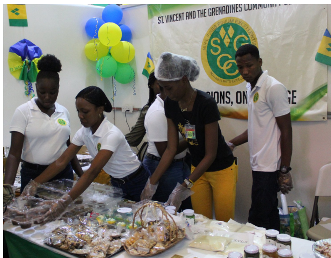
Representatives of the St. Vincent and the Grenadines Community College - Everything Vincy Expo 2019

The COVID-19 pandemic forced countries to both implement and adapt preventative and containment measures. These measures includes, but are not limited to, the restriction of movement, border closures, and strict sanitization protocols all of which affected demand and supply chains critical to the operation and survival of lives and livelihoods. Consequently, the additional pressures of the pandemic induced economic contraction in many countries.