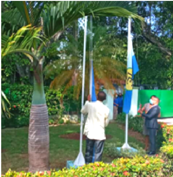
Hoisting of the Caribbean Community (CARICOM) flag at the Embassy of St. Vincent and the Grenadines, Havana Cuba