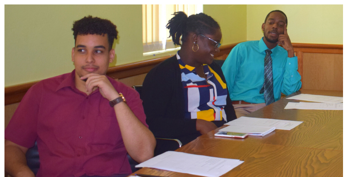
Session with members of the Carnival Development Committee

Session with some member of staff of the Ministry of Finance, Economic Planning, Sustainable Development and Information Technology