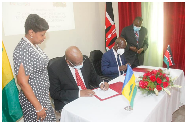
Signing of Communiqué establishing formal diplomatic ties between St. Vincent and the Grenadines and the Republic of Kenya

Collaboration between St. Vincent and the Grenadines and the Republic of Kenya has been long standing, as both countries customarily collaborate through membership and participation in the Commonwealth, Organisation of Africa, Caribbean and Pacific States (OACPS) and the United Nations.