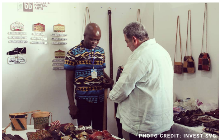
Dr. Hon. Ralph E. Gonsalves and Vendor - Everything Vincey Expo 2019

The Government of St. Vincent and the Grenadines and MSMEs have cooperatively developed and implemented recovery measures specific to the needs of these enterprises and the development goals of the nation. These measures took into account the conditions of the new normal, that if insufficiently managed can place additional pressure on the limited capacity of these enterprises. The road ahead for MSMEs should be paved by resilience, digitization, inclusivity, innovation and sustainability.