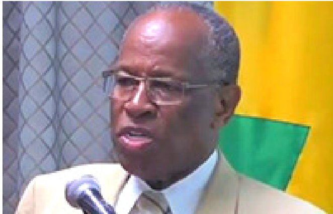
Hon. Sir. Louis Straker