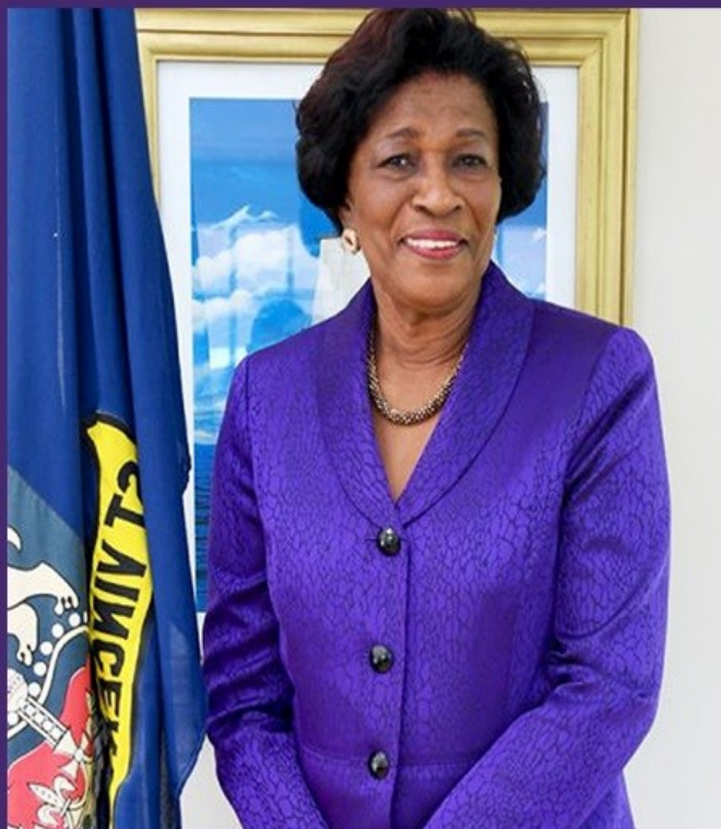
Her Excellency Susan Dougan Governor General of St. Vincent and the Grenadines

We salute these Caribbean women leaders who have made history in Caribbean politics!