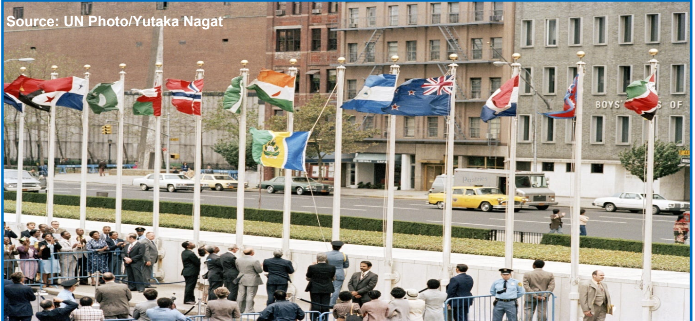
The flag of St. Vincent and the Grenadines being raised at the 35th Session of the United Nations General Assembly on September 17, 1980 to signify the country's admission as the 154th Member State of the United Nations.