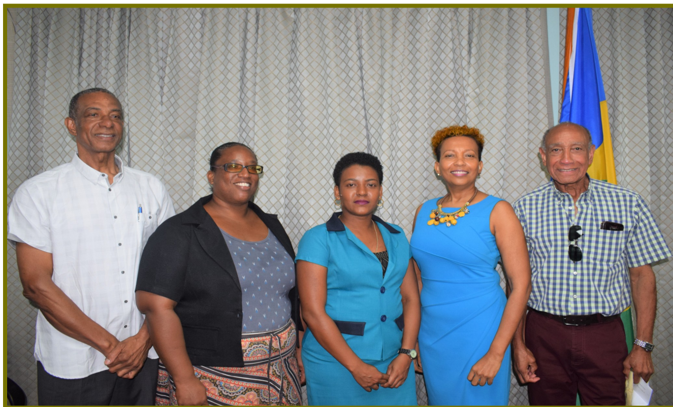
Representatives of the St. Vincent and the Grenadines and Friends (Reading) and the St. Vincent and the Grenadines New London Association with local Head Teachers

The Vincentian diaspora in the United Kingdom continues to make monetary contributions as tangible investments in developing the local education system.