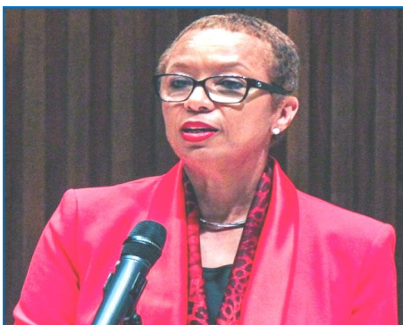
Her Excellency, I. Rhonda King, Ambassador and Permanent Representative of St. Vincent and the Grenadines to the United Nations in New York

During the month of March several meetings were held to address the technical readiness of the council to address and operate within the context of the COVID-19 pandemic given the council's inability to meet.