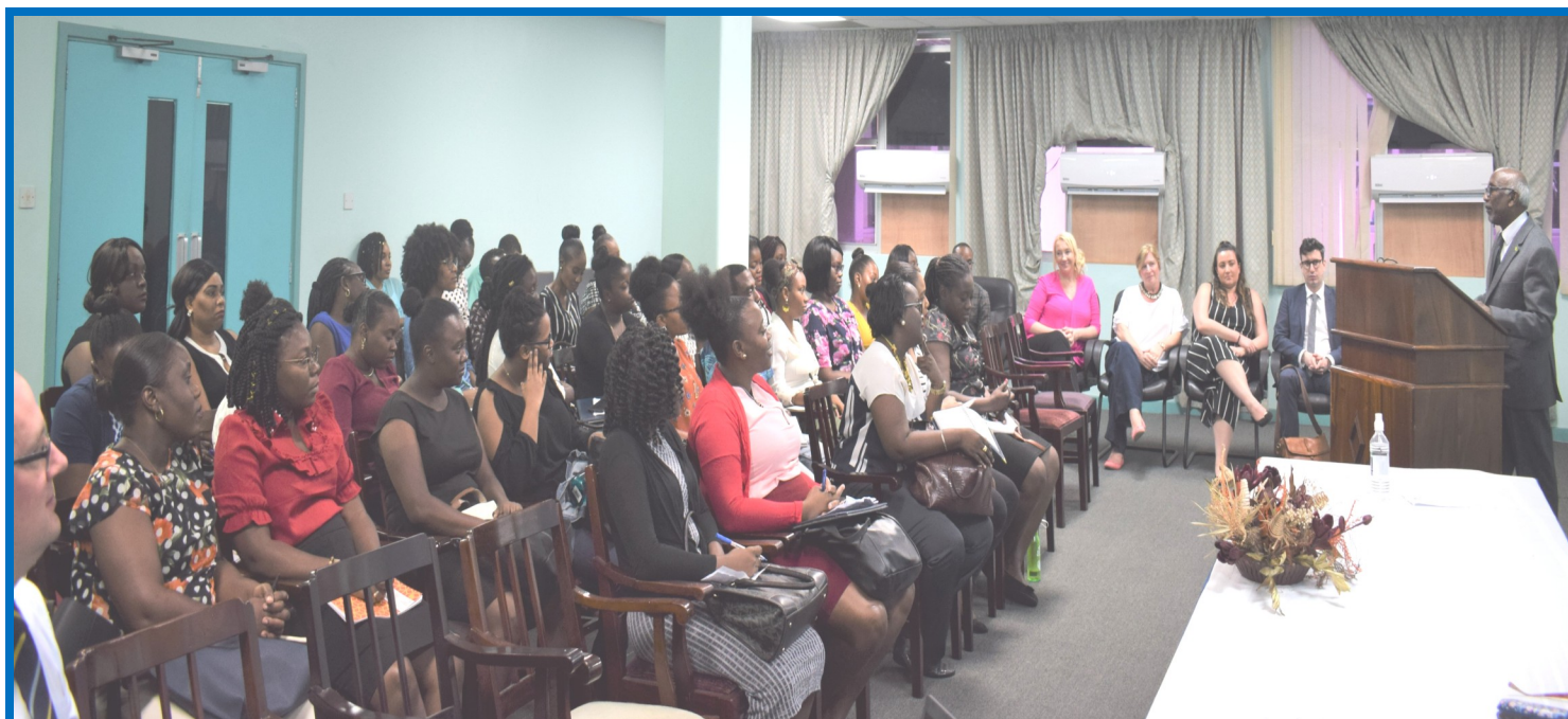
Section of the candidates (unemployed registered nurses) at the briefing session for the recruitment process.

In January 2020, officials from Health Education England (NEE) conducted a one-week recruitment exercise in St. Vincent and the Grenadines. Sixteen (16) of the registered nurses from the first phase of the recruitment left for the UK in March 2020, and will take up positions at various hospitals in the UK. These include East Lancashire Hospitals, Lancashire Care, Morecambe Bay, Lancashire Teaching Hospitals and Blackpool Hospitals.