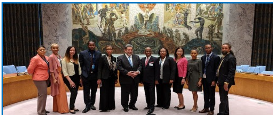
St. Vincent and the Grenadines' UN Security Council Team with Prime Minister, Dr. The Hon. Ralph E. Gonsalves and Foreign Minister Sir. Louis Straker.

As the world continues to grapple with the COVID-19 pandemic and its associated effects, the Vincentian team at the United Nations continues to make great strides as part of its obligation as a member of the UN Security Council.