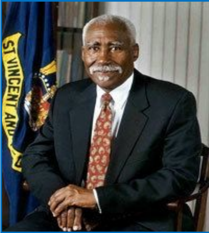
His Excellency, Sir Frederick Nathaniel Ballantyne, GCMC, MD, DSc.

Sir Frederick's contributions to the field of medicine have been hallowed not only in St. Vincent and the Grenadines but worldwide. He was awarded an honorary Doctor of Science (D.Sc.) degree by the University of the West Indies (UWI) in 2009 for his contribution to the field of medicine. He was also honoured in 2013 by Upstate Medical University in Syracuse, New York with a humanitarian award.