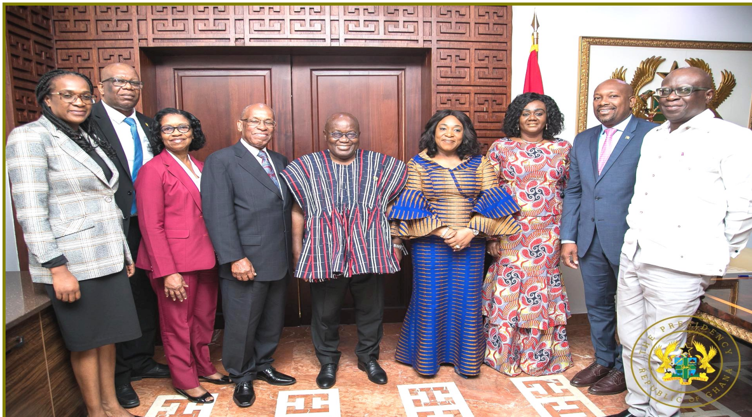
Members of the Vincentian and Ghanaian delegation at the Permanent Joint Commission for Cooperation (PJCC) meeting in Accra, Republic of Ghana.

The inaugural meeting of the Republic of Ghana-St. Vincent and the Grenadines Permanent Joint Commission for Cooperation (PJCC) was held in Ghana from February 11 to 14, 2020.