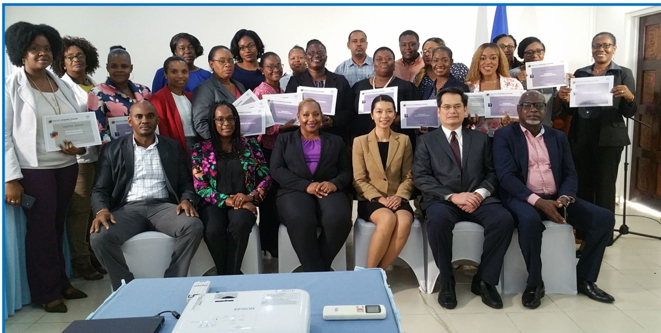
Participants and Facilitators of the United Nations Conference on Trade and Development (UNCTAD) Empowerment Program (Second Phase)