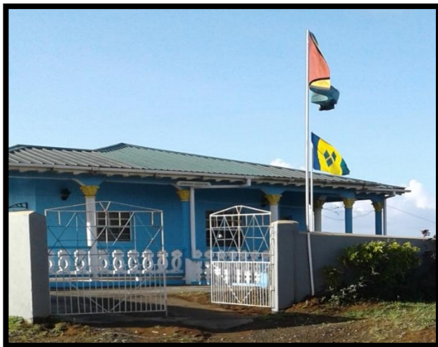
Richmond Hill Office