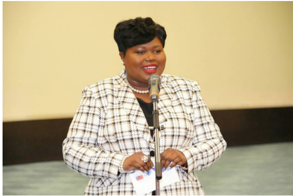
Hon. Keisal Peters; Minister of Foreign Affairs and Foreign Trade of St. Vincent and the Grenadines speaking at welcoming ceremony at the "Empower Women! Empower LAC!" Forum.

On February 14 2023, The Honourable Keisal Peters, Minister of Foreign Affairs and Foreign Trade made her inaugural visit to the Republic of China (Taiwan).