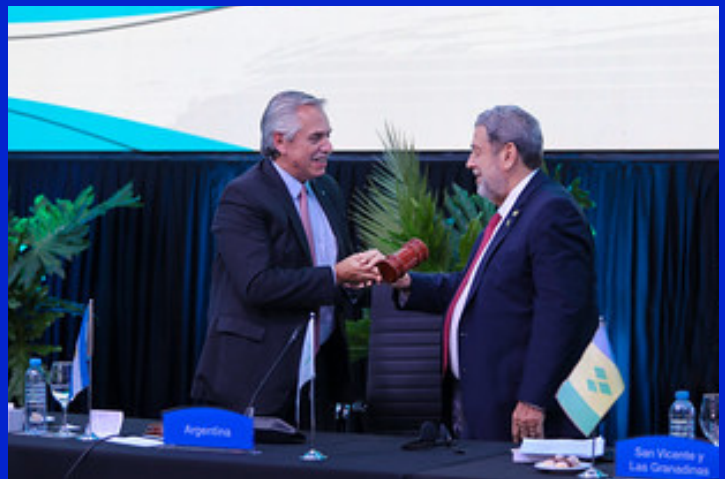
Dr. Alberto Fernández; President of the Argentine Republic and Dr. Hon. Ralph E. Gonsalves; Prime Minister of St. Vincent and the Grenadines