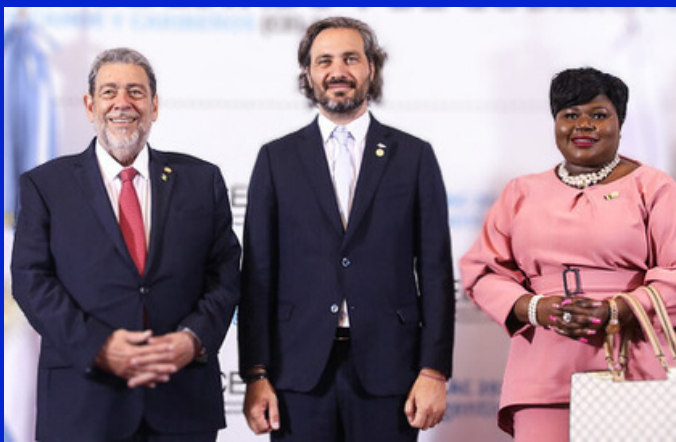
L-R: Dr. Hon. Ralph E. Gonsalves; Prime Minister of St. Vincent and the Grenadines, Santiago Cafiero - Minister of Foreign Affairs, International Trade and Worship of the Argentine Republic, Hon. Keisal Peters; Minister of Foreign Affairs and Foreign Trade of St. Vincent and the Grenadines.

Having achieved unanimous support, Saint Vincent and the Grenadines is the first CARICOM country to assume the Pro Tempore Presidency of the Community of Latin American and the Caribbean States (CELAC) for the period 2023.