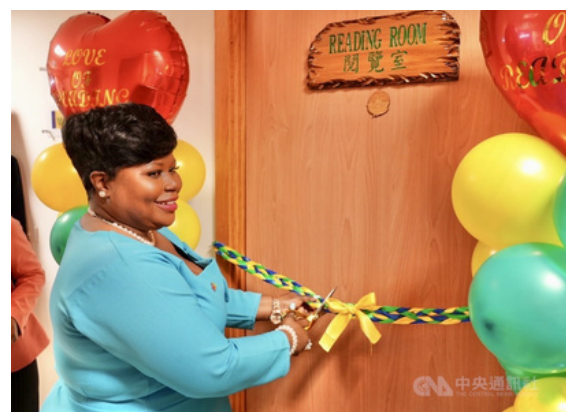
Hon. Keisel Peters; Minister of Foreign Affairs and Foreign Trade cutting the ribbon to signal the official opening of the reading room housed at Taipei's Diplomatic Quarters