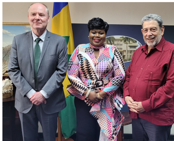
L-R: H.E. Andres Bengtcén; Ambassador of the Kingdom of Sweden to Saint Vincent and the Grenadines, Hon. Keisal Peters, Minister of Foreign Affairs and Foreign Trade; Dr. The Hon. Ralph E. Gonsalves, Prime Minister.