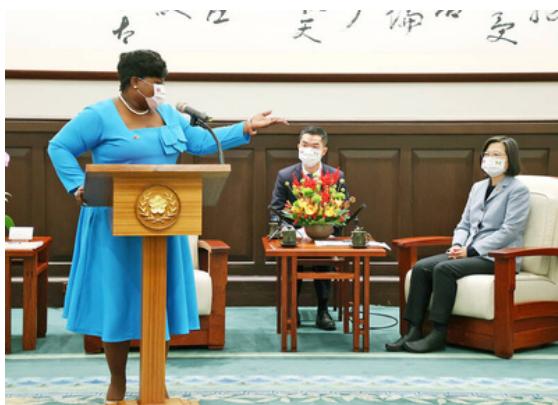
Hon. Keisal Peters; Minister of Foreign Affairs and Foreign Trade met with Her Excellency Tsai Ing-wen; President of the Republic of China (Taiwan) during her inaugural visit to Taiwan in February, 2023

Minister Peters attended The "Empower Women! Empower LAC!" Forum pertaining to the ongoing project "Assisting the Economic Empowerment of Women in Latin America and the Caribbean in the Post-Pandemic of COVID-19 Technical Assistance for Women's Employment and Entrepreneurship and Financial Inclusion". Through the ambit of bilateral cooperation, the Government of the Republic of China (Taiwan) has supported this project. To date, hundreds of Vincentians have benefitted from this programme.