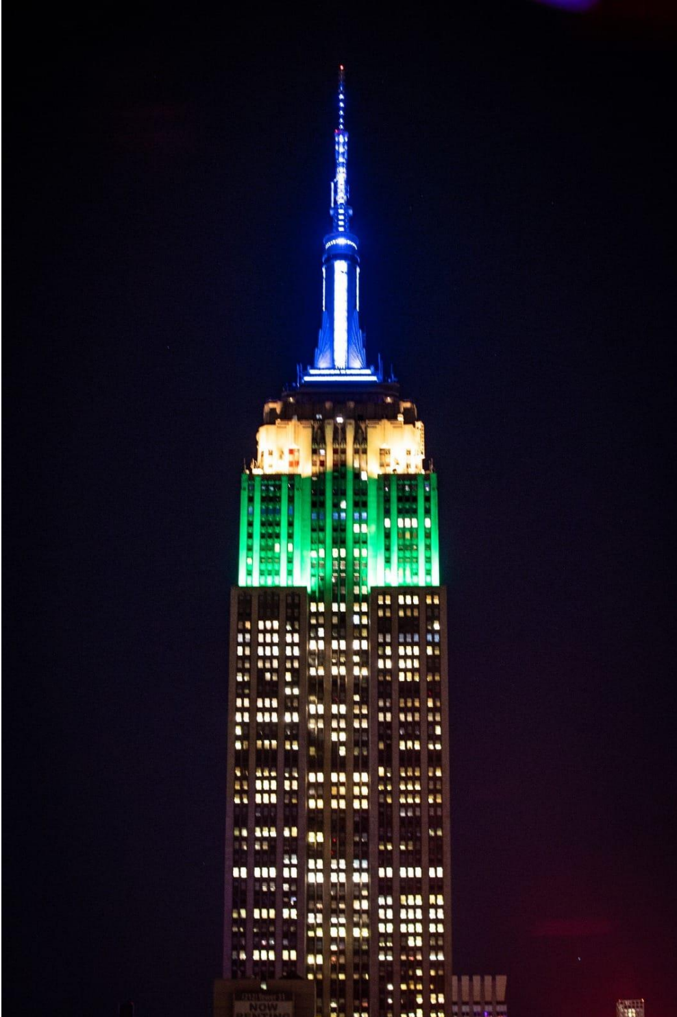
Lighting of the New York Empire State Building in the national colours of Saint Vincent and the Grenadines in commemoration of the 43 rd Independence Anniversary. The Empire State Building was lit from 5:58 p.m. on Thursdays 27 th October, 2022 to Friday 28 th October at 2:30 a.m.