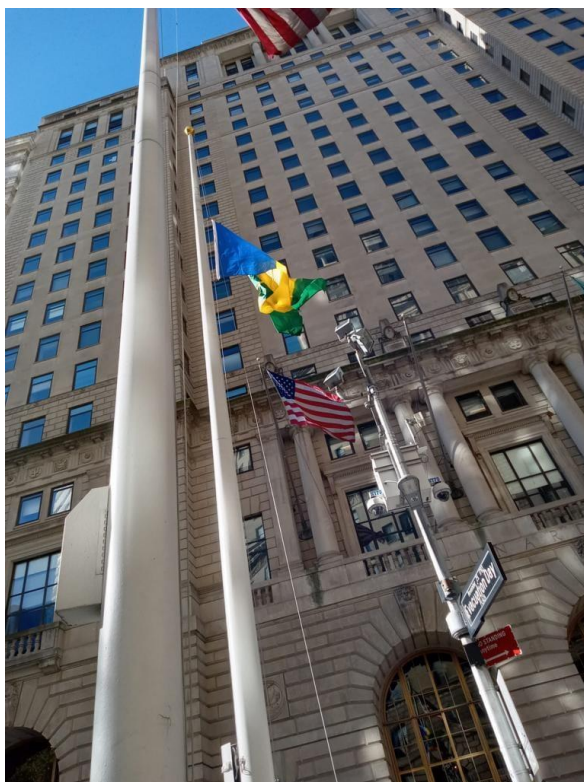
Inaugural Flag Raising ceremony held by the SVG Consulate in New York to commemorate the 43 rd Independence Anniversary of Saint Vincent and the Grenadines