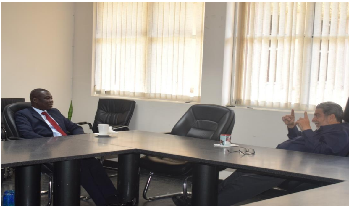
H.E., Samuel Yaw Nsiah, High Commissioner of the Republic of Ghana to Saint Vincent and the Grenadines meets with Dr. The Hon. Ralph E. Gonsalves, Prime Minister of Saint Vincent and the Grenadines for bilateral discussion.