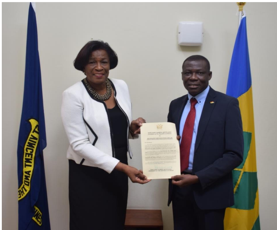
H.E. Samuel Yaw Nsiah, High Commissioner of the Republic of Ghana to Saint Vincent and the Grenadines presented Letters of Credence to H.E. Dame Susan Dougan, GCMG, OBE, Governor General of Saint Vincent and the Grenadines at the Government House on Wednesday, 7 th September, 2022.