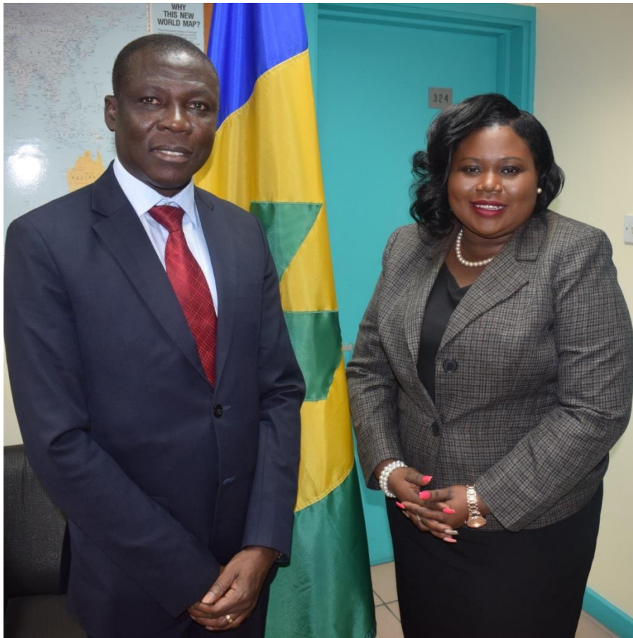
H.E. Samuel Yaw Nsiah, High Commissioner of the Republic of Ghana to Saint Vincent and the Grenadines and Senator The Hon. Keisal Peters, Minister of Foreign Affairs and Foreign Trade